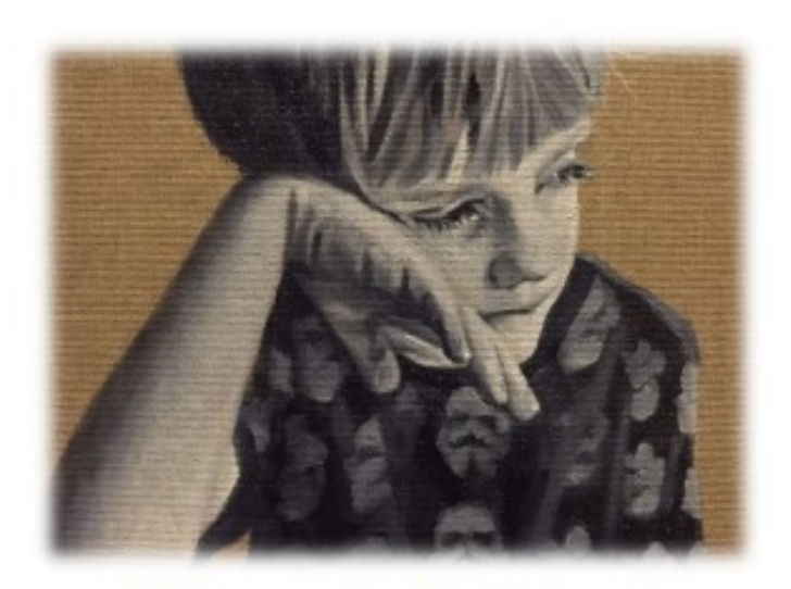
Paint a portrait in four weeks!

Learn new techniques each week to produce a realistic portrait of yourself or a loved one, stage by stage. During the 4 weeks you will study colour theory, proportion, features, and expression.